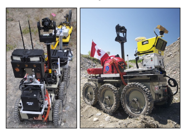
Figure 1: Robot configurations used in the mock mission scenarios in the Sudbury impact crater in Canada. Week one on the left, and week two on the right.

Consider the example network in Figure 2. Here, there are three sites of interest that are being investigated in parallel. While operators on Earth discuss a decision on where to sample at site A, they can send the robot to site B and then C to collect imagery before returning to site A. Then, while the robot is sampling at site A the mission team can use the data from Site B and C to se-